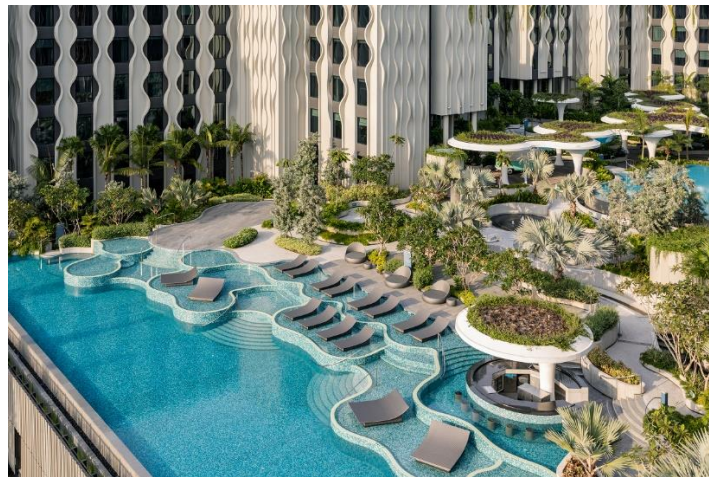
The Pamukkale Pool is a recreation of the famed Turkish terraced pools with excellent views of the island's daily fireworks display and mesmerising sunsets

Of the hotels' array of amenities, the sprawling pool deck on level three between Village Hotel Sentosa and The Outpost Hotel Sentosa continues to remain a focal talking point and a popular photo backdrop. There are four thematic pools – the Children Play Pool with mini slides adorning the shallow wading pools; the Adventure Pools which host activities like movie nights; the Lazy River loop for an afternoon floating by; and the picturesque Pamukkale Pool, a recreation of the famed Turkish terraced pools with excellent views of the island's daily fireworks displays and mesmerising sunsets.