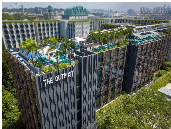
The Outpost Hotel Sentosa