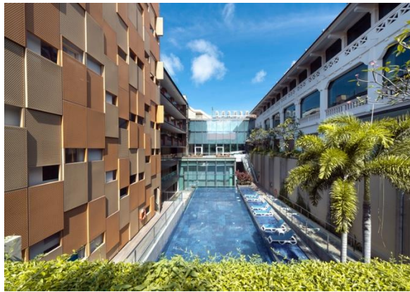
Oasia Resort Sentosa