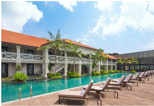
The Barracks Hotel Sentosa